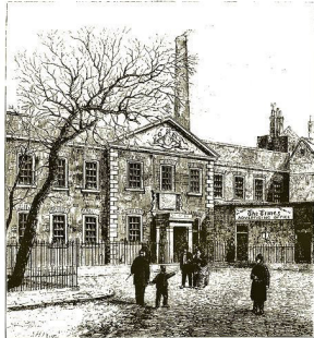
Antique etching of Printing House Square

At school I had been undecided whether I wanted to become a musician or a writer. Music won, and I was entered for the Royal College of Music in London. A few weeks before going