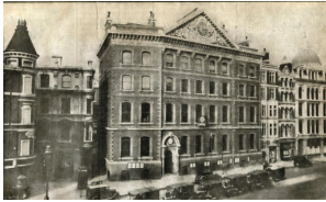
The Times building in the 1940s

one of the most distinguished and romantic buildings in London.