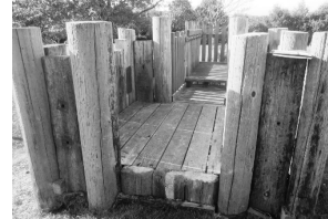
The fort today

The Parish Council allotment site on Oxford Street is an enclosed,